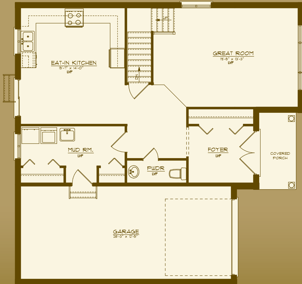
Main Floor 905 Sq. Ft.